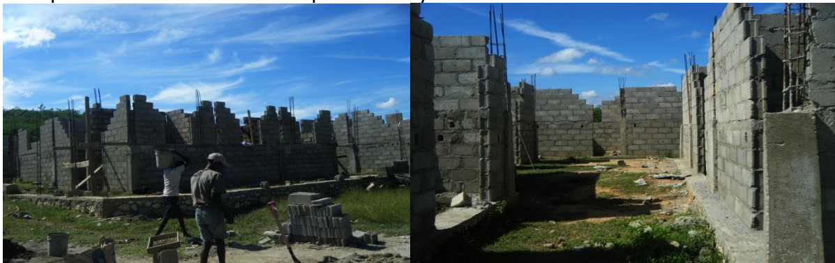
Construction is ongoing year-round by local workers to build the first medical clinic in Jacsonville, Haiti.

Despite some major setbacks with recent storms passing through Haiti, community members in Jacsonville have been able to continue progress on completing the area's first primary care clinic. Current construction efforts are focused on finishing the walls of the clinic. Fundraising efforts remain ongoing to build a roof for the clinic. With financial support, it is anticipated that the clinic will be operational by Summer 2013.