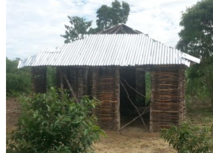
The new house, under construction.