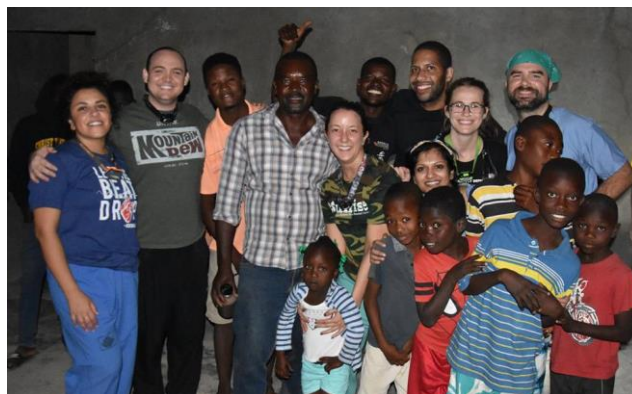
January trip participants getting to know the wonderful Jacsonville community.

https://www.nytimes.com/2018/02/03/us/new-orleans-haiti-arcade-fire.html