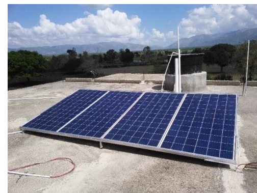
Solar panels on the roof of the mission house

were installed, and tree seedlings were planted in the field with the help of the school children.