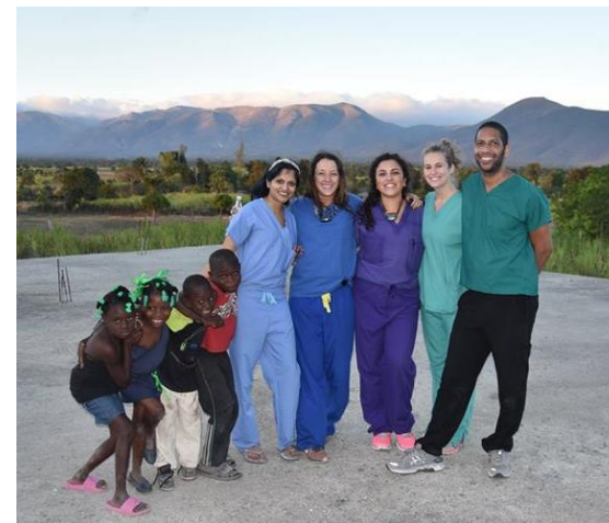
Some of the medical staff from the January trip with Jacsonville children.