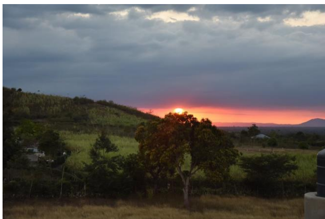
One of the many beautiful sunsets in Jacsonville

Sante Total, which means "Total Health" in Haitian Kreyol, aims to provide sustainable healthcare to rural communities in the Central Plateau region of Haiti. We believe you can only improve health through eradicating the disease of poverty. The Sante Total approach considers the entire person- physical health, well-being, education, and employment, to be essential to health and quality of life.