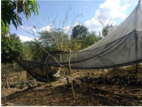
The site of the nursery

In January of 2019, Fanfan set up a trip to visit with Gaby and provide a report on the status of the project in Jacsonville.